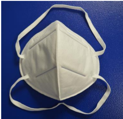
Respirator under test